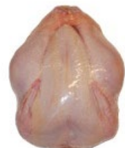
Wrapped Color Range Breed Red Bro Processed 4.50 lbs. 9-11 wks.