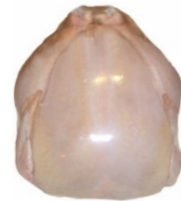
Wrapped Heavy Cornish Processed 5.25 lbs. 6-8 wks.

High Yield Broad Breasted Cornish Cross breed that makes great fryers (broilers) and roasters because of the weights that can be achieved. This breed has an excellent feed conversion, livability, strong legs, and a maximum white meat yield with a plump full confirmation. At 6 to 8 weeks of age processed weights of 4 ½ to 6 lbs. can be obtained. Higher weights can be obtained depending on the final grow out duration. With using a well-managed care and feeding program, customers have achieved processed weights of 10 to 14 lb. roasters and capons within 10 to 14 weeks. This breed is also use for Cornish-Poussins (French for young chicken) 28 to 31 days will yield a processed 1 to 1 ¼ lb. bird; 32 to 38 days 1 ½ to 2 lb. bird