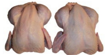
Not wrapped Colored Meat Bird Processed 4.50 lbs. 9-11 wks.

Performance traits include increased foraging activity, a greater resistance to disease, livability, strong legs, and excellent feed conversion. All alternative breeds will have a longer breast bone, legs (drumstick), and wing span. They will also have a darker yellow fat compared to the pale yellow fat of the fast growing breeds. What these birds will not have is that double breast meat and fast growth rate.