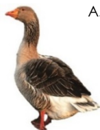
A. Buff, Tufted Buff Classic Roman Tufted Roman French Toulouse

Tufted Buff originate from the Buff and Tufted Roman breeding, same color as the Buff but with a tuft of feathers on the top of their head.