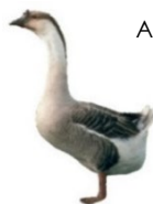
Assorted Geese Our choice

Toulouse geese Good temperament with beautiful gray and white plumage, an easy breed to raise and most common for the barnyard.